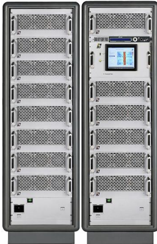
Linear AT8001™ featured

OFFERING INDUSTRY-LEADING BROADCAST SOLUTIONS – EMPOWERING BROADCASTERS TO DO MORE WITH LESS