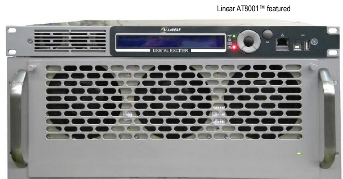
Linear AT8001™ featured

Linear Advanced • TV - Representative photo profiles single drawer unit with power to 500W